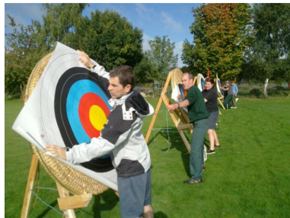
Gradually the targets are prepared thanks to the many club helpers.

Nearly ready with the colour prize markings!