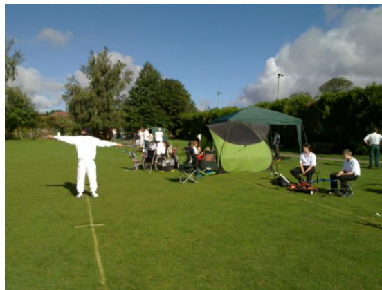
The competition gets ready with a few stretches.