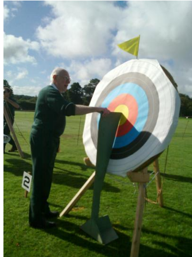
Final adjustments and we are nearly ready