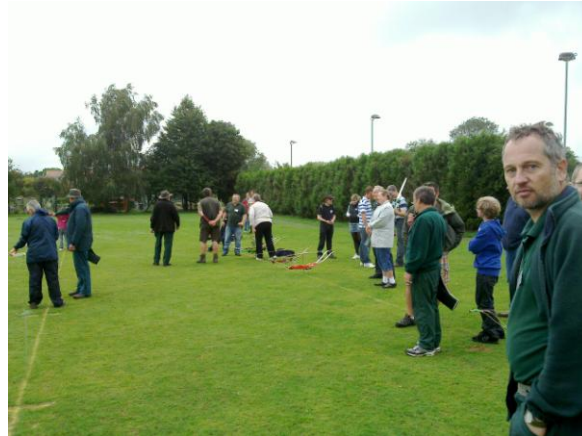
Last Day of the beginners course